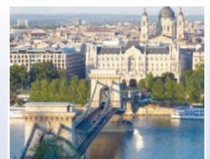
Budapest Chain Bridge