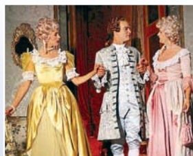
Opera house performers