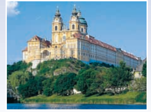
Melk Abbey, Austria