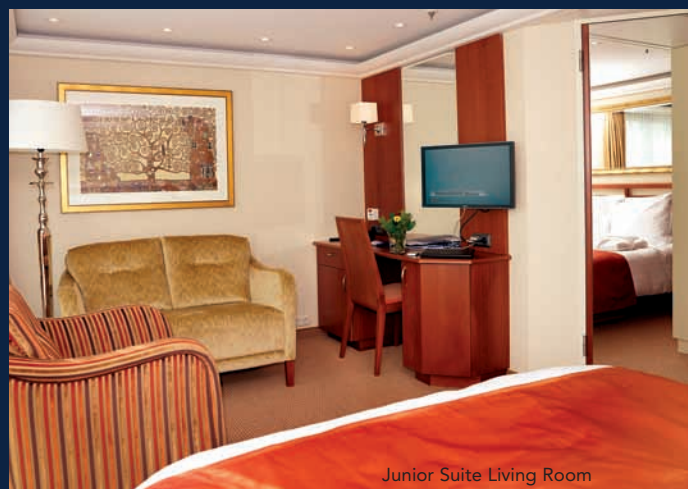
Junior Suite Living Room