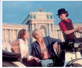
Fiaaker ride in Vienna