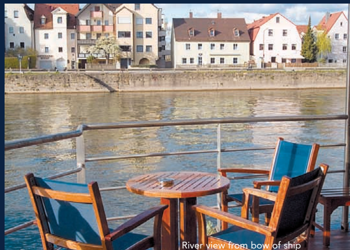
River view from bow of ship