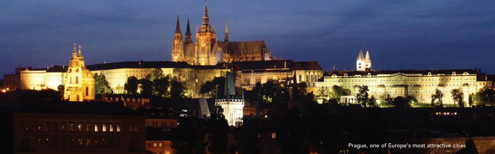
Prague, one of Europe's most attractive cities