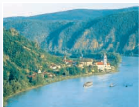
Wachau Valley, Austria

See the Imperial Hofburg Palace, the Vienna Opera House, Ringstrasse, and awe-inspiring St. Stephen's Cathedral and visit the National Library on your guided tour. Then, enjoy a free afternoon to shop, explore or visit one of the cities many museums or palaces. Enjoy dinner as you continue your journey past Slovakia and cruise overnight to Budapest, Hungary's vibrant capital. (B,L,D)