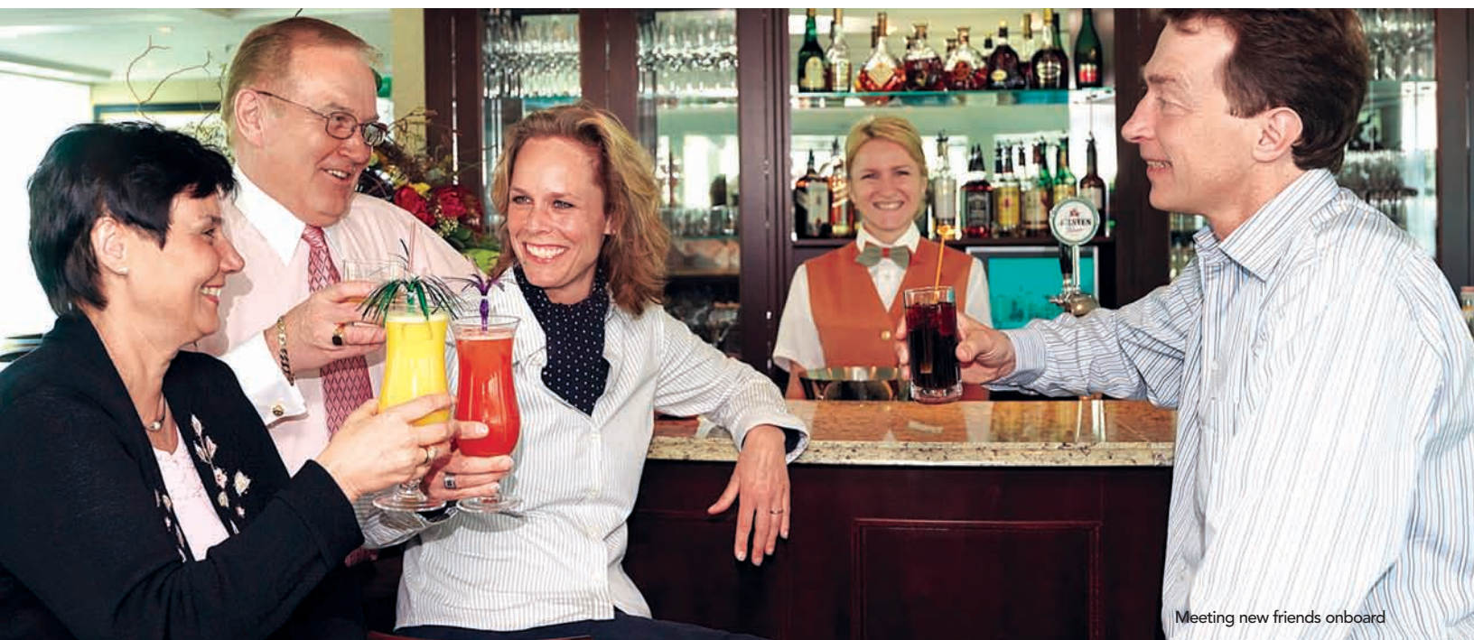
Meeting new friends onboard

DAY 1 (Aug 20) DEPART TORONTO Board your overnight flight to Prague, Czech Republic. Transportation: Air Canada / Lufthansa Airlines